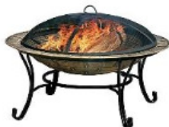
Portable Fire Pit